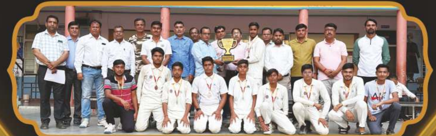
Runner-up in Cricket Tournament at District Level (U-17 BOYS)