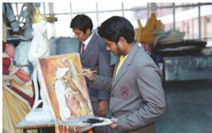
Colour & Brush-Showcasing artistic skills