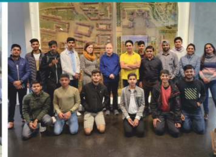
Heidelberg University, Germany