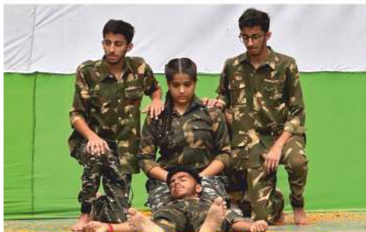
Martyr's Day- Tribute to Our Soldiers