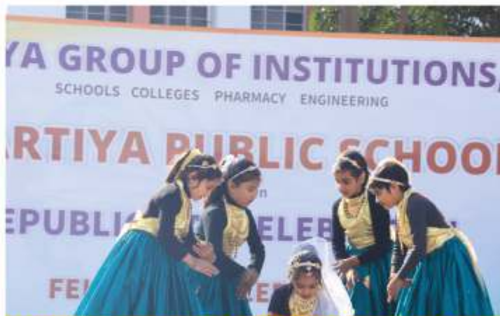
Culturally Rooted -Girls Performing Folk Dance