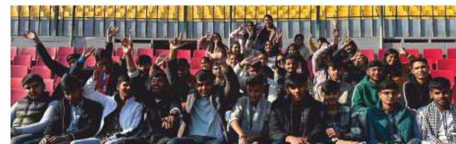
Dharamshala Cricket Stadium

Educational Tours and Excursions are organized by the school to bring out the children from a tedious routine and to make them more keen and adventurous.