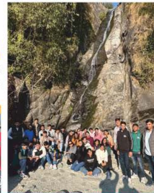
Bhagsunag Waterfall-McLeod Ganj