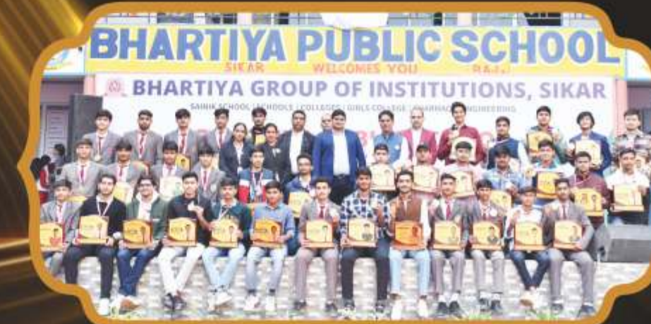
Felicitation of All India Rankers in CBSE Board Exam