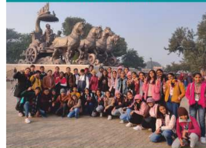
Educational Tour-Delhi and Kurukshetra