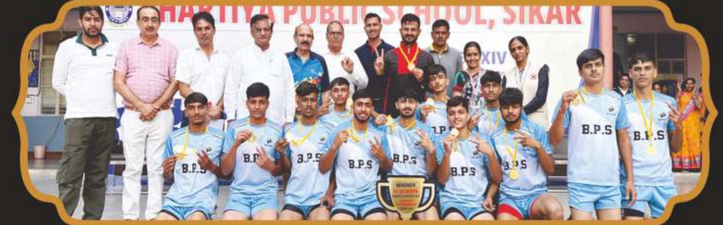
Winner in Kabaddi Cluster XIV (U-19 BOYS)

They give us a tremendous amount of energy and encouragement that propel us to do better.