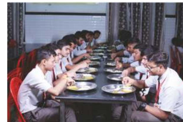
Place of Love & compassion