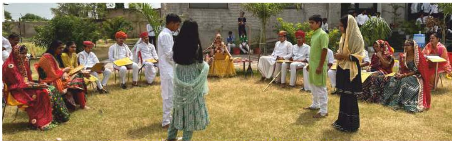
"चौपाल" Act Demonstrating Rural Administration